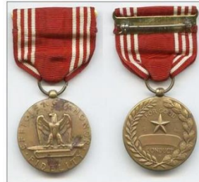
Army Good Conduct Medal 1941-Present (Slot Brooch)

At left is a photograph of the left-hand pocket of Chet's wool army jacket.