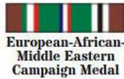
European-African-Middle Eastern Campaign Medal

The American Campaign Medal on the left was intended to recognize those military service members who had performed military duty in the American Theater of Operations during World War II.